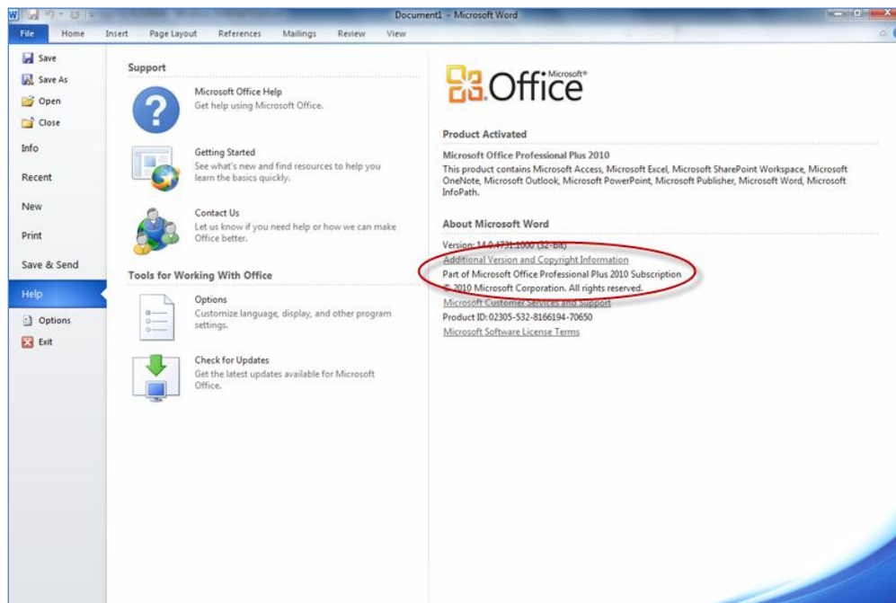
Figure 3: Office Professional Plus subscription message

To determine if a version of Office is a subscription version, users can open any of the installed Office Professional Plus applications, and then view the Help screen. To view the help screen, click File , and then click Help . On the Help screen, below the Version information and Additional Version and Copyright Information hyperlink, subscription versions of Office Professional Plus will display the following message: "Part of Microsoft Office Professional Plus 2010 Subscription" Non-subscription versions of Office will not contain the word "subscription." See Figure 3 for an example of this message.