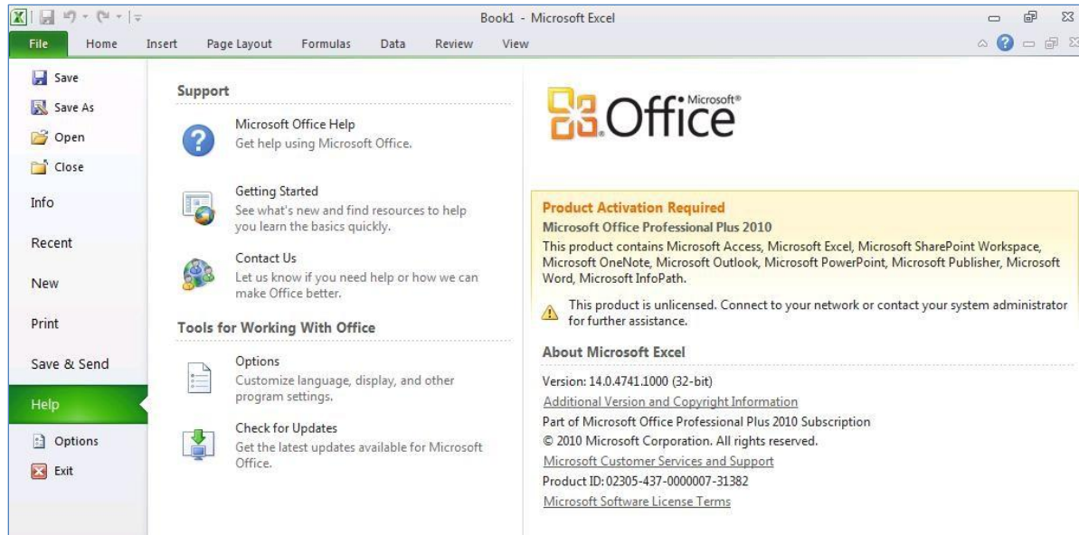
Figure 1: Office Professional Plus that has not been activated

To view the Help window, click File , and then click Help . Figure 1 shows a message that prompts the user to activate the product.